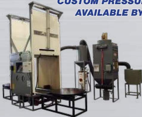
Custom (72"W x 72"H x 48"H) pressure cabinet with dual vertical doors & automated turntables