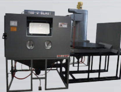
Custom (60"W x 60"D x 44"H) pressure cabinet with H.D. turntable built into side door

*Custom blast cabinets are engineered and manufactured to meet your blasting requirements*