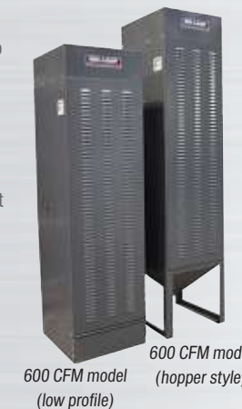
600 CFM model (low profile) 600 CFM model (hopper style)

• Dust is collected either in a drawer or a hopper with clean-out hatch. The hopper style is recommended and standard configuration unless there is a height restriction. If you require low-profile, the drawer style is available.