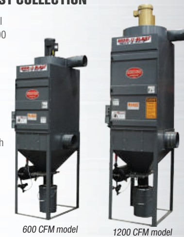
600 CFM model 1200 CFM model