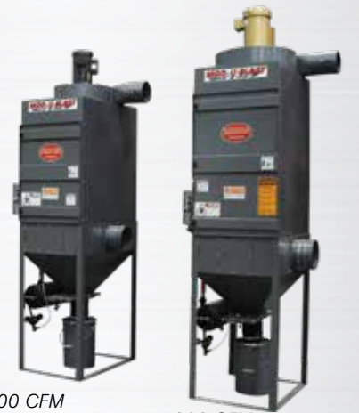
600 CFM model